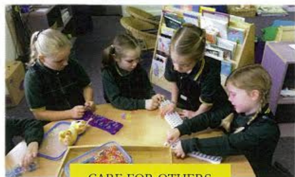
CARE FOR OTHERS