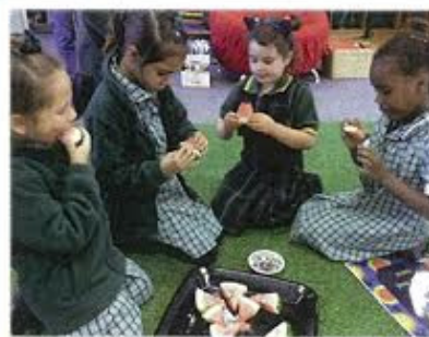
CARE FOR LEARNING

Happy Mother's Day to all our Mums, Carers and Nans! Thank you for all that you do!