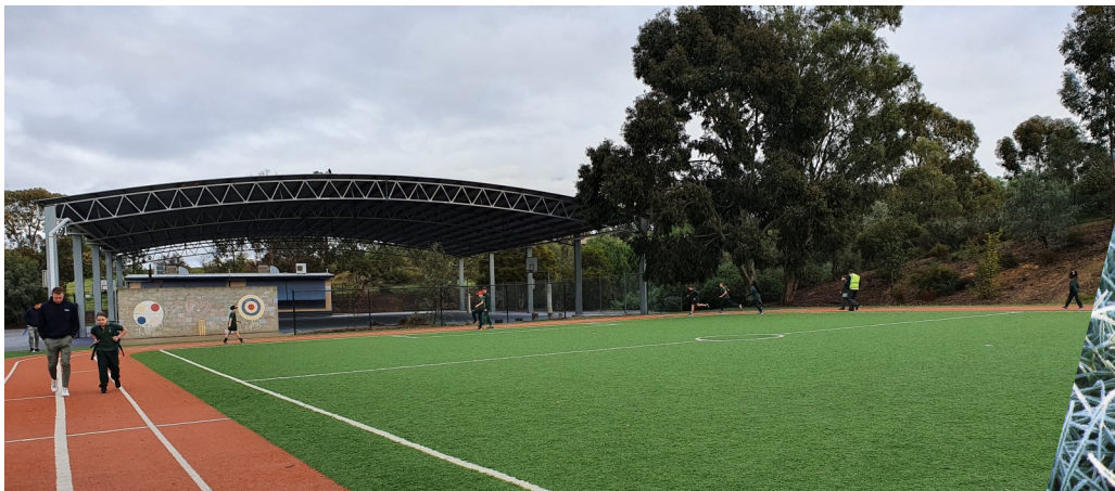
Our morning walks are getting chilly—remember to rug up in the mornings when you come back to school!