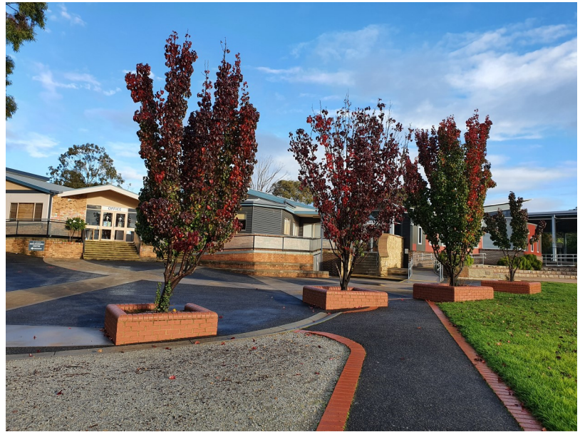
Nature around the school is putting on a beautiful show of colour!