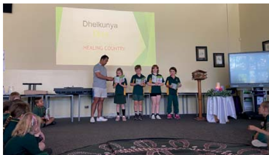
Our presentation at assembly